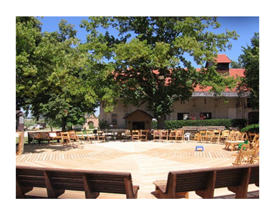
The meeting place in Klosterzimmern