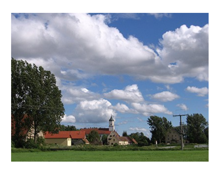
View of Klosterzimmern