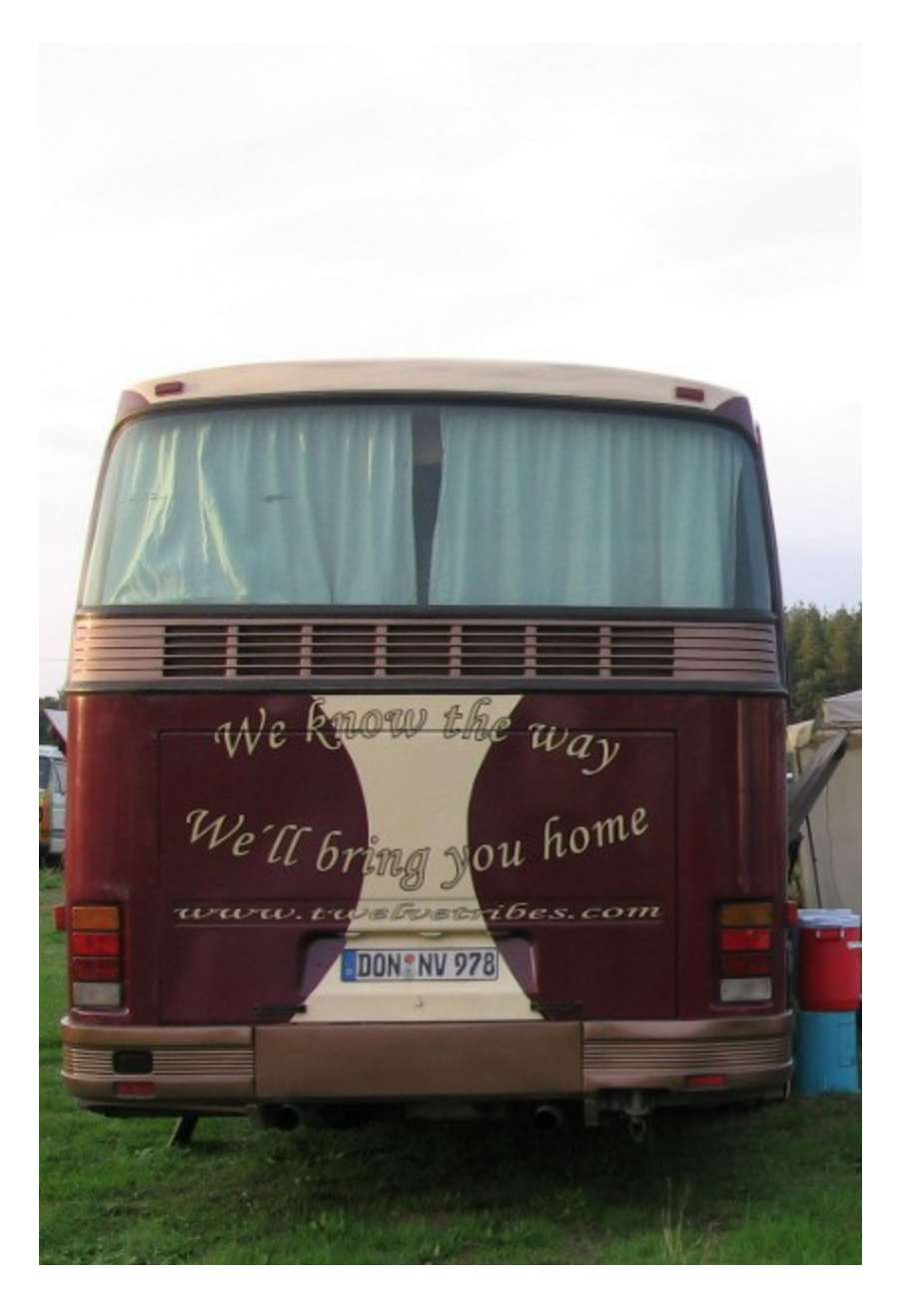
The bus of the Twelve Tribes at the Missionary Camp on the occasion of the Folk Festival in Görlitz 2006