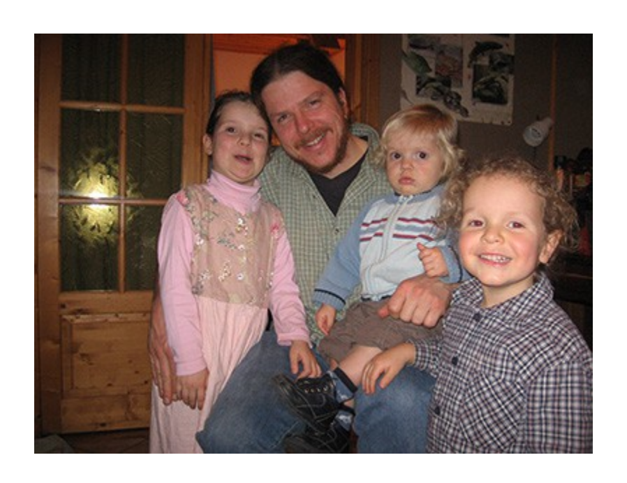
With my children shortly after returning from six months of exile